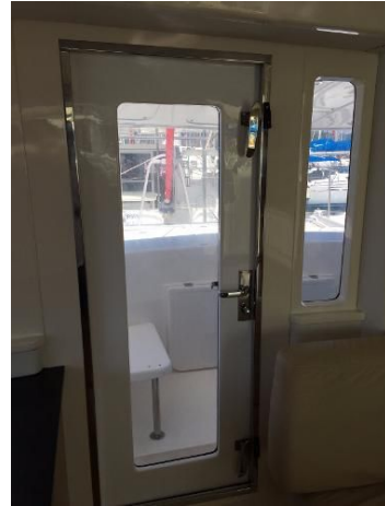
Acces Door Front Cockpit