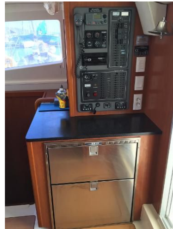
Electric Panel & Fridge