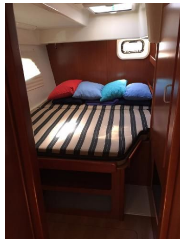
Port Aft Cabin