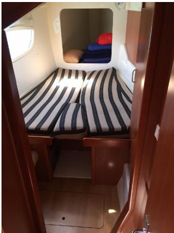
Forward STB Cabin