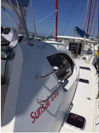
Sun sail 444