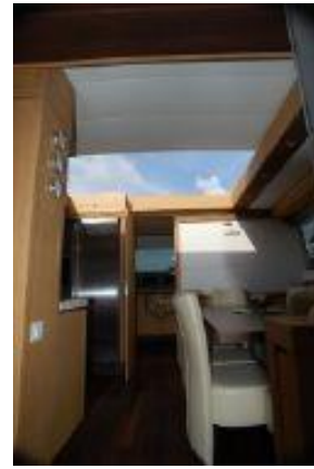
> Retractable roof over dining and galley