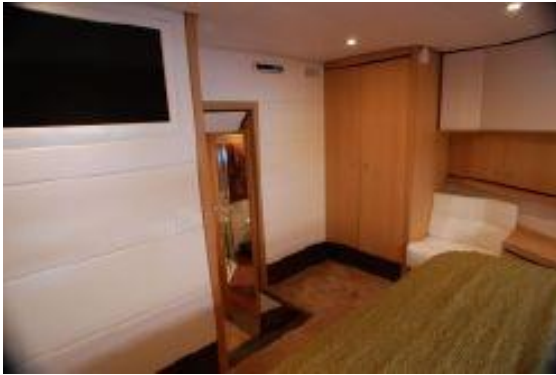
> VIP looking aft