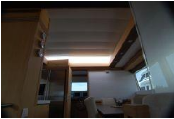
> Retractable roof over dining and galley