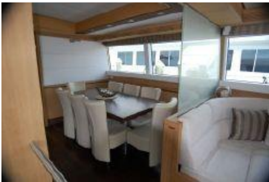
> Dining Area