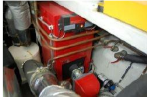
> ER - Kabota