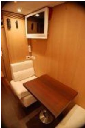
> Crew Dinnette