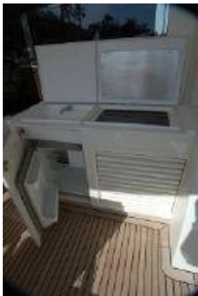
> Aft deck BBQ, sink, and fridge