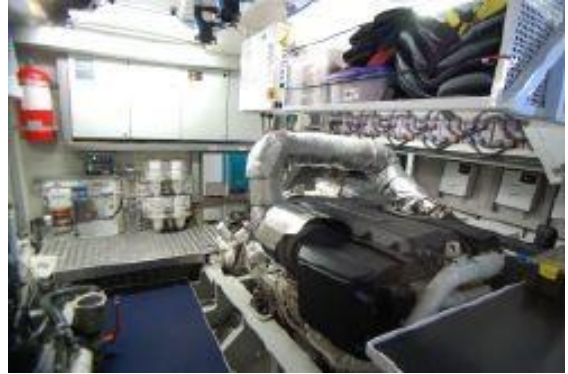
> ER - Stbd side looking fwd