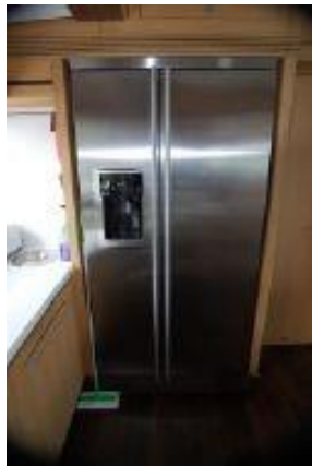
> Galley fwd