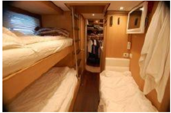
> Crew Stateroom looking fwd