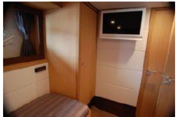
> Guest Stateroom head - aft