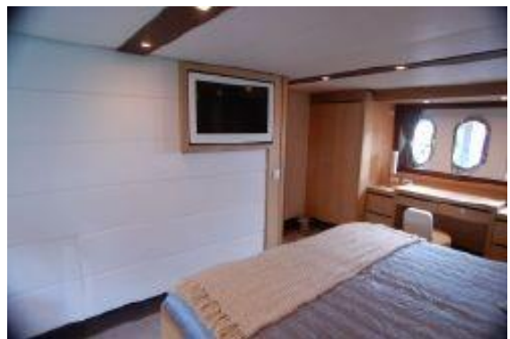
> Master Stateroom looking fwd