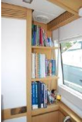
> Wheel House Books