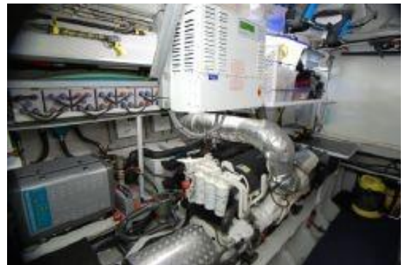
> ER - Stbd side looking aft