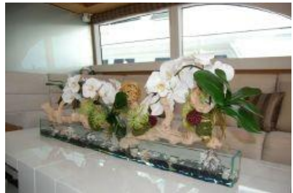
> Dining Table