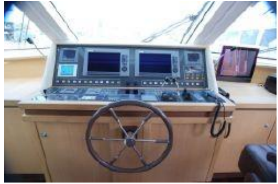
> Wheel House Controls