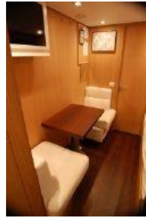
> Crew Dinnette