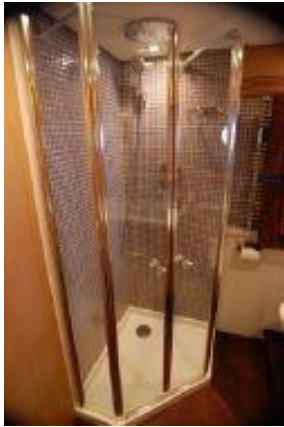
> VIP Shower