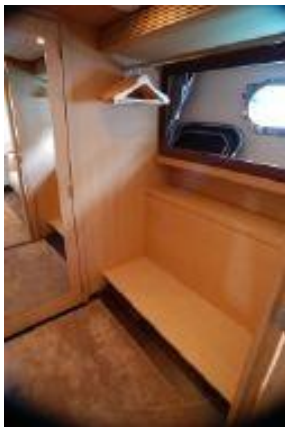
> Master Stateroom Locker