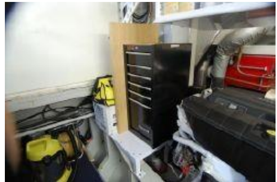
> ER - Port side tool chest