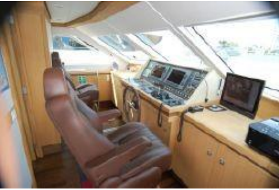
> Wheel House