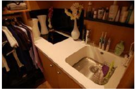
> Crew galley