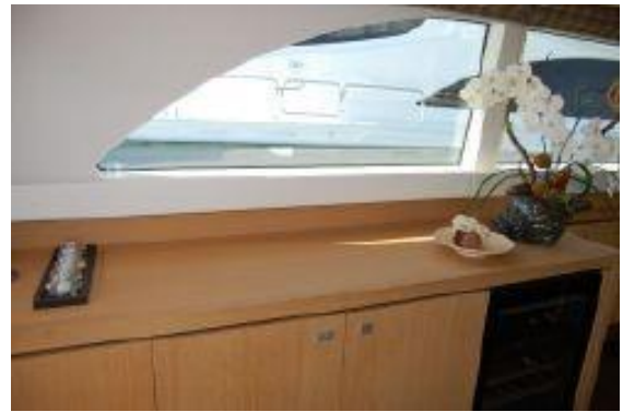
> Main Salon pop-up TV