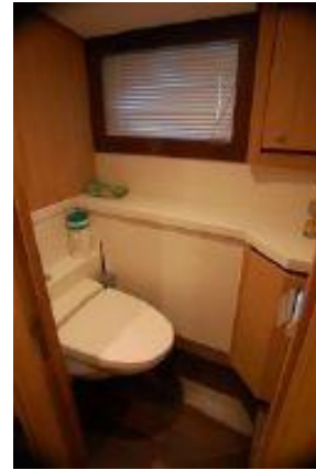
> Crew Head