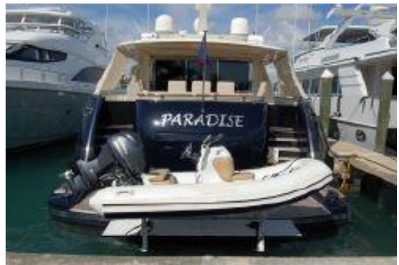
> Tender on lift system