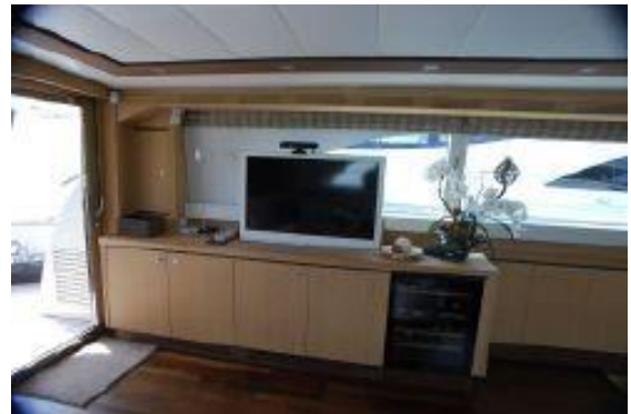
> Main Salon looking to port