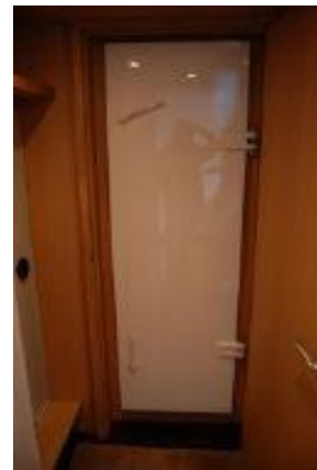
> ER access from master stateroom locker