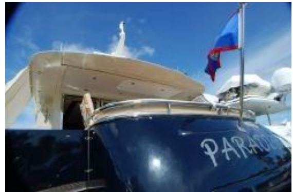
> Aft Deck Awning retracted