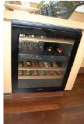
> Main Salon wine cooler