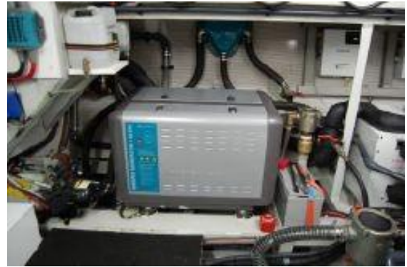
> ER - 6kW Genset