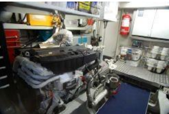
> ER - Port side looking fwd