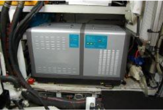
> ER - 25kW Genset