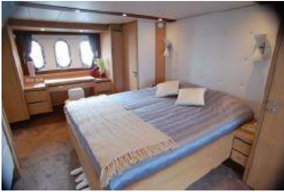
> Master Stateroom looking to stbd