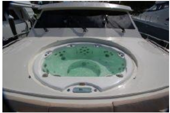
> Foredeck Hot Tub