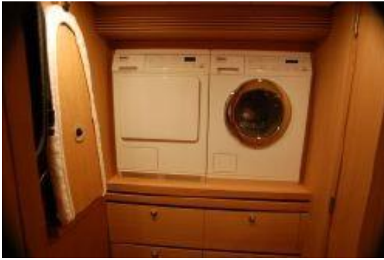
> Laundry room / Crew foyer