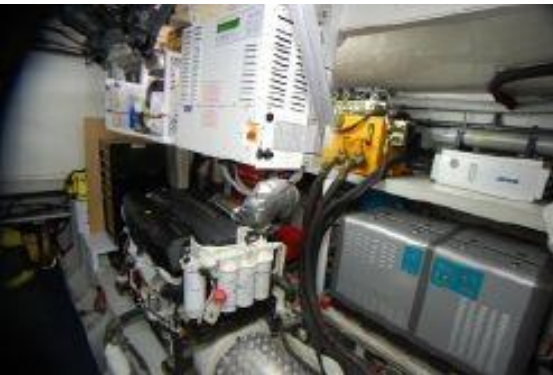
> ER - port side