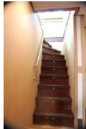
> Main Stairs