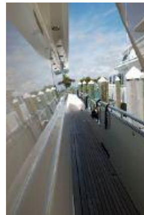
> Side Deck