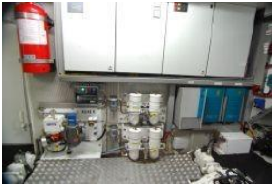
> ER - fwd bhd