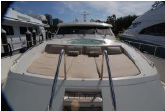
> Foredeck Sun Pad