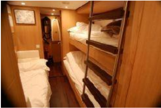
> Crew Stateroom looking aft