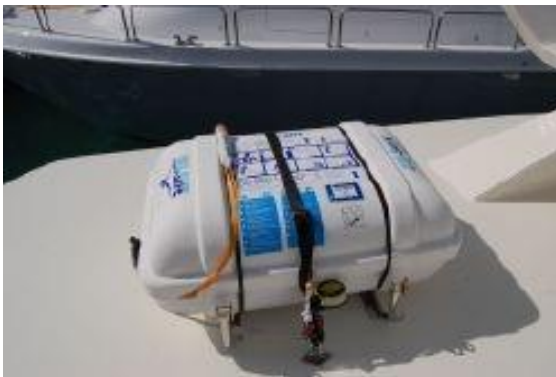
> Life raft