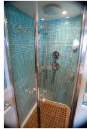
> Master Stateroom Shower