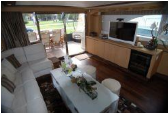
> Main Salon looking aft