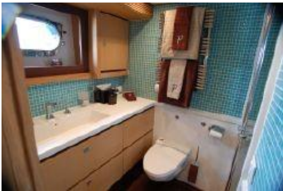
> Master Stateroom Head