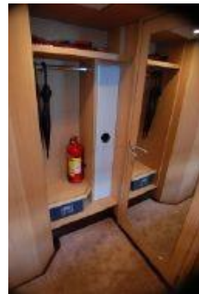
> Master Stateroom locker and safe