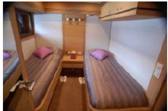
> Guest Stateroom fwd