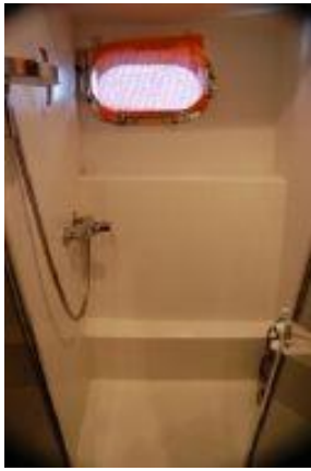
> Crew Shower