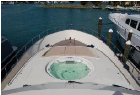
> Foredeck view