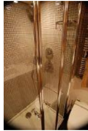
> Guest Stateroom shower - fwd