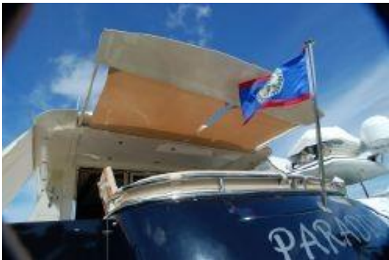
> Aft Deck Awning extended