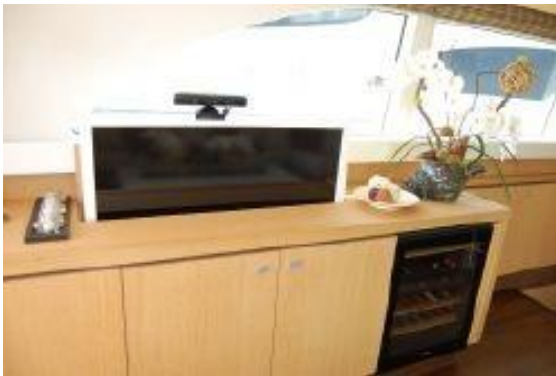
> Main Salon pop-up TV