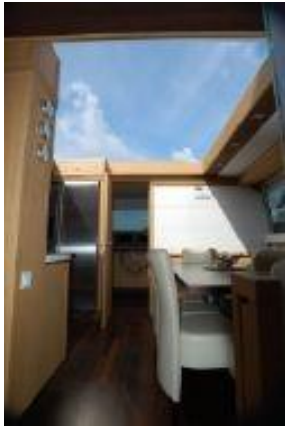
> Retractable roof over dining and galley