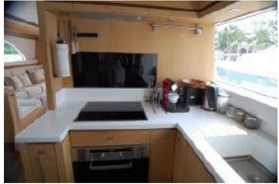
> Dining and Galley looking to port