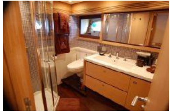
> VIP Head