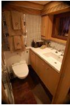
> Guest Stateroom head - fwd