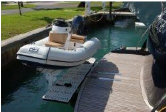
> Tender on lift system