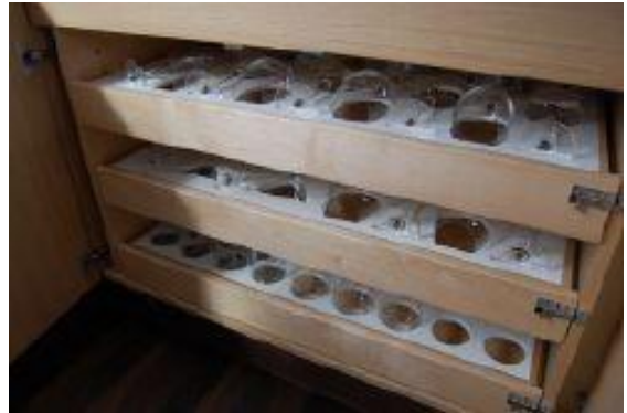
> Wheel House glass storage