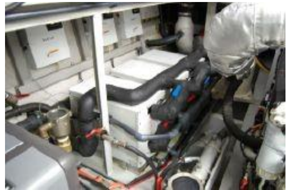
> ER - A/C