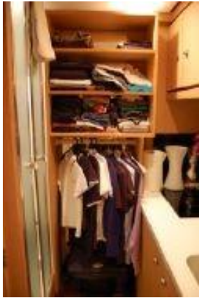
> Crew extra storage