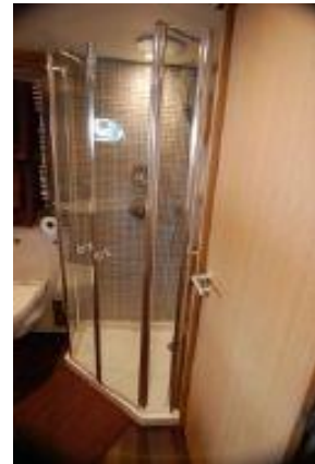
> Guest Stateroom shower / Day head