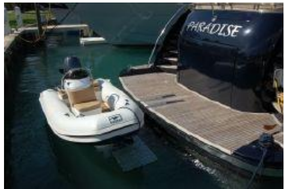
> Tender on lift system