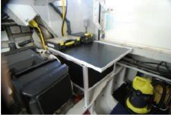
> ER - Work Bench