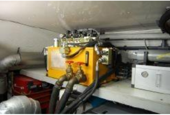
> ER - Hyd