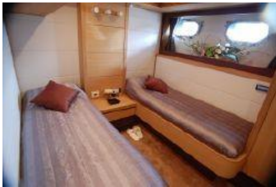
> Guest Stateroom head - aft