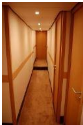
> Lower deck hallway