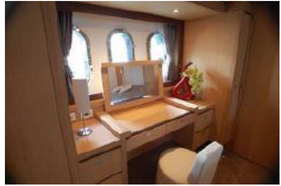
> Master Stateroom vanity