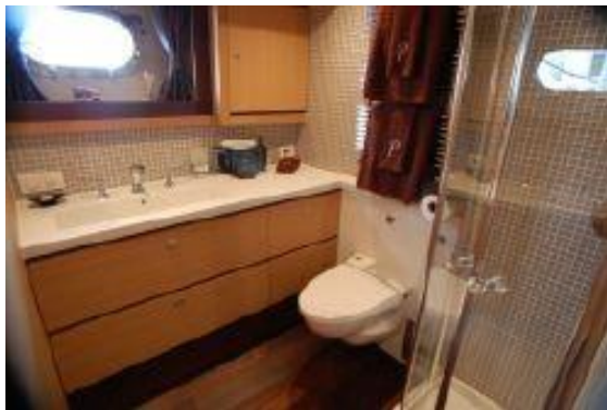
> Guest Stateroom head / Day head