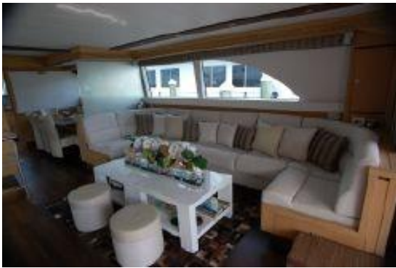
> Main Salon looking to stbd