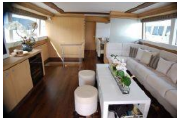
> Main Salon looking forward